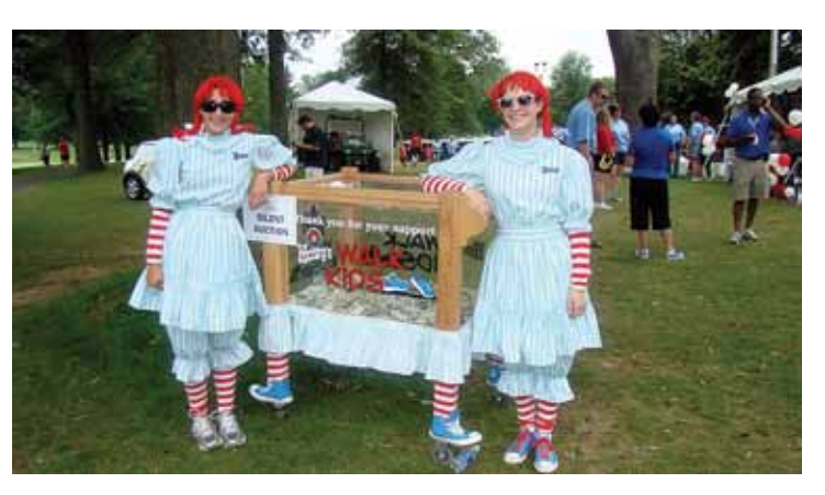
Wendy's Walk for Kids supported Catholic Charities youth services.