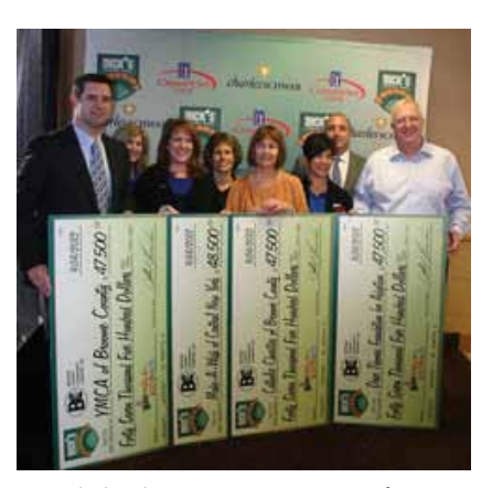
YOU helped us raise over $190,000 for Wendy's Walk for Kids 2012!!