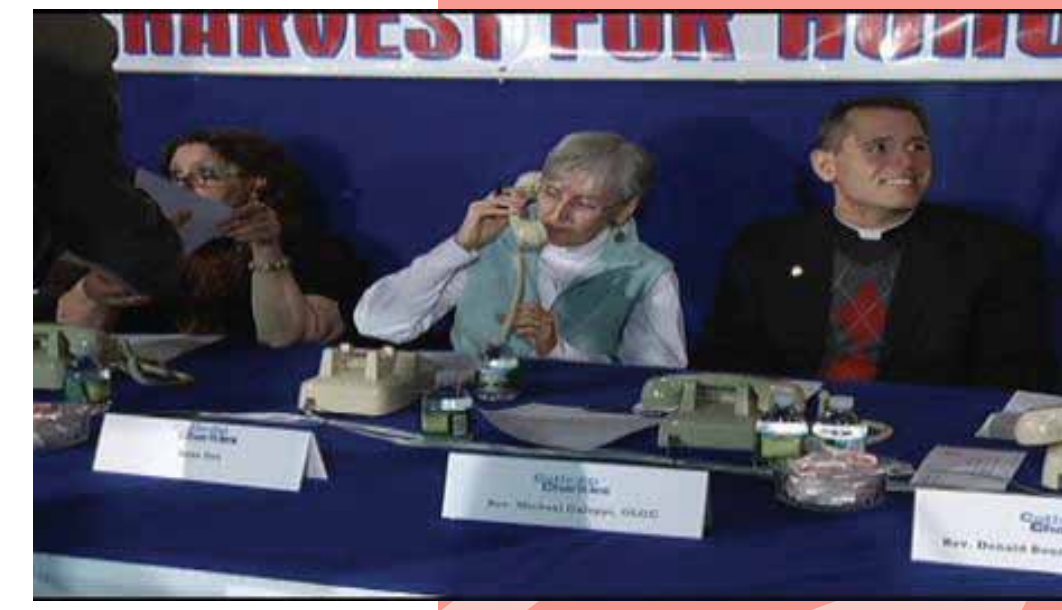
Harvest For Hunger Telethon 2012.