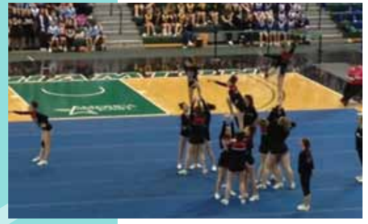
CYO cheerleaders show their spirit at the Cheerleading Competition at the BU Events Center.