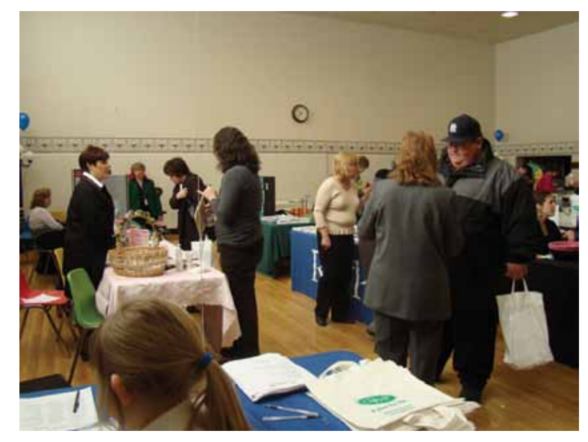
The Special Events Committee sponsors a Staff Wellness Fair.